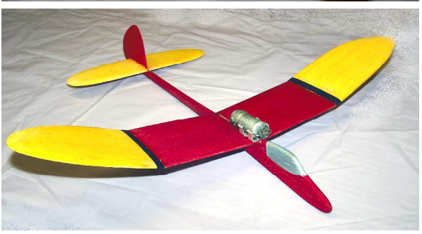
Above: Walter Snowdon's delicious Imp (top) and KK Gnat. Both are brilliantly finished with food colourants.

Walter writes: "The Javelin is built from a template [Jetex Natters, SAM Speaks Oct 1990] and finished with one coat sanding sealer and one coat of very thin enamel. The Skyray is finished with one coat of sanding sealer and two coats of 'Pound Land Primer Aerosol'. gives a lovely antique satin finish and is only £1 a can! The Imp and Gnat are finished with food colouring – one part colouring to one part water applied with a soft tissue. You can make repeat applications after drying to give deeper colours. I pre-sand the balsa and if you use as little water as possible there is no grain rise. It is better to shape and colour before assembly so you don't get pale glue marks. When dry, buff gently with a soft cloth. Two very thin spray coats of dope gives a lovely waterproof finish.